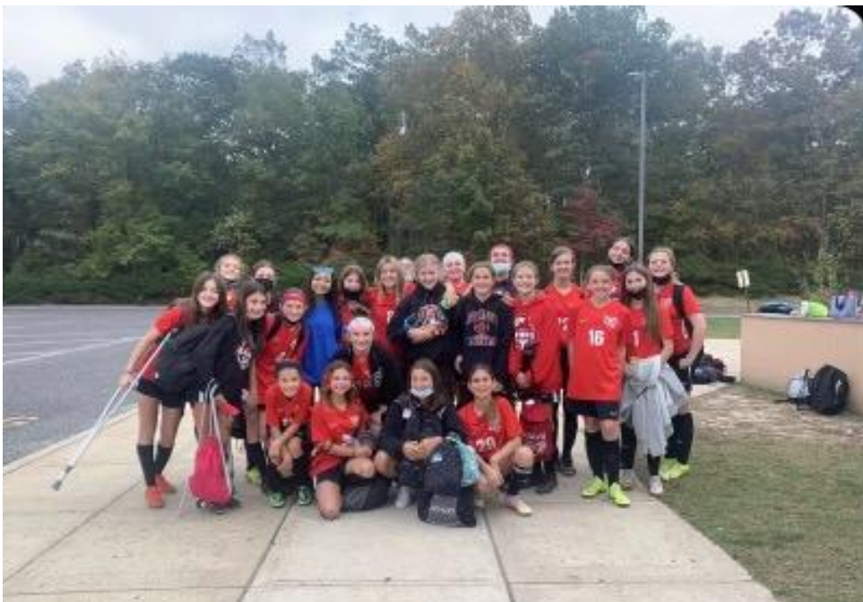
The McAuliffe girls soccer team.